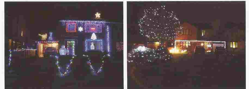
Last Years Christmas Light Winners

Winners will be announced in the Spring 2018 Newsletter.