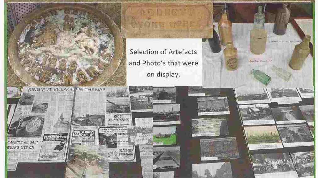
Selection of Artefacts and Photo's that were on display.

For anyone wishing to view these, they are on display at the Parish Council office, Ryefields Road.