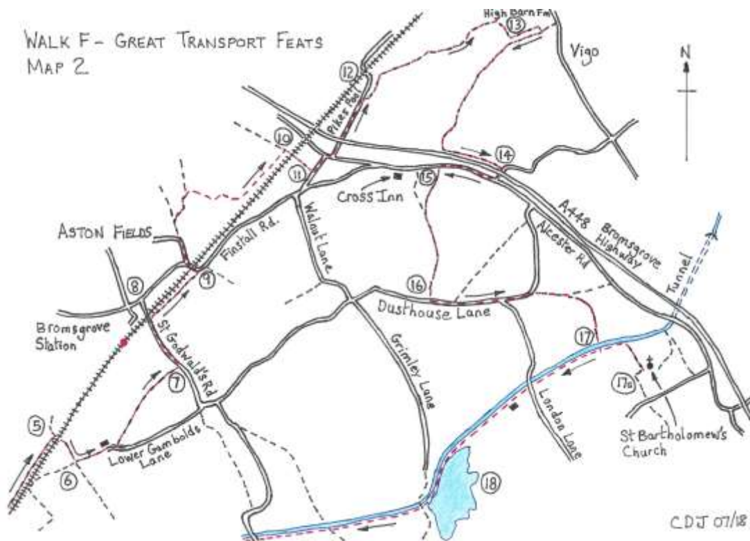
MAP 2 OF WALK